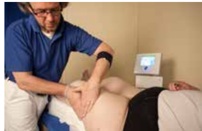
Application example: gentle yet powerful, deep oscillation decongestion in lipoedema.

For questions and further information about deep oscillation therapy I am at your disposal.