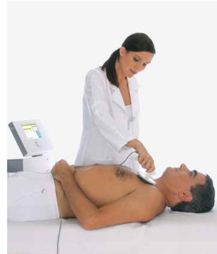
GB 2018-05. Errors excepted. Technical data subject to change without notice.

DEEP OSCILLATION can help quickly and effectively!