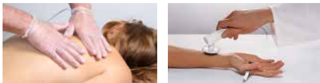
The therapy is applied either with gloves or a special applicator

For the treatment, the patient holds a titanium neutral element loosely between the fingers. The pleasant therapy effect of deep oscillation is created beneath special gloves of the therapist or a specially designed hand applicator (second contact) circling over the tissue.